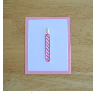
11. Cut Accent Piece