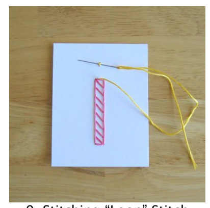
9. Stitching "Loop" Stitch