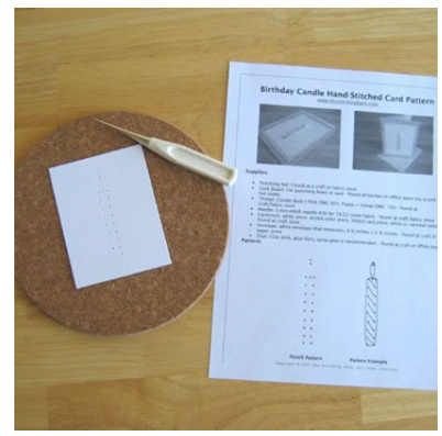
3. Punching with Pattern