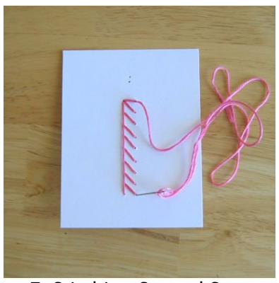
7. Stitching Second Step