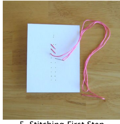
5. Stitching First Step