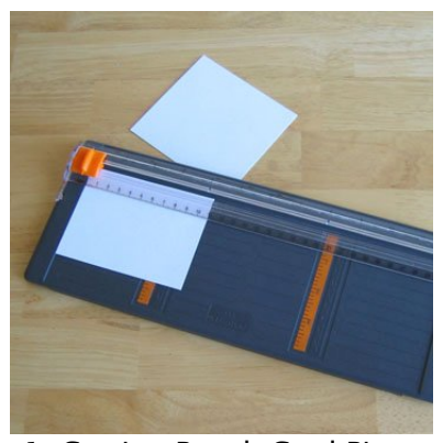
1. Cutting Punch Card Piece