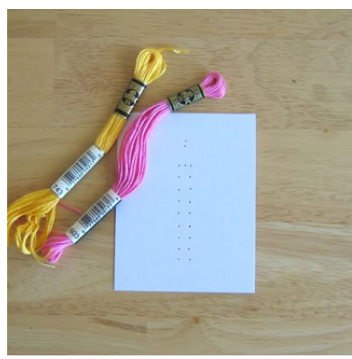
4. Ready to Stitch