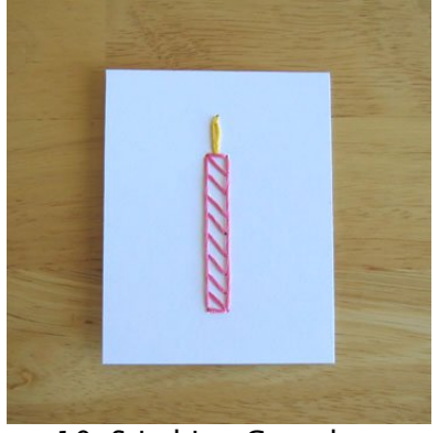
10. Stitching Complete