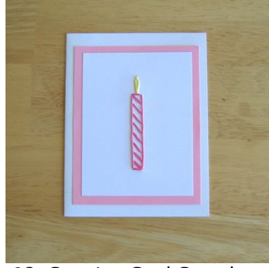
12. Greeting Card Complete