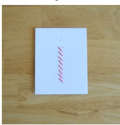
6. Completed First Step