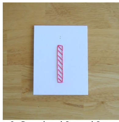
8. Completed Second Step