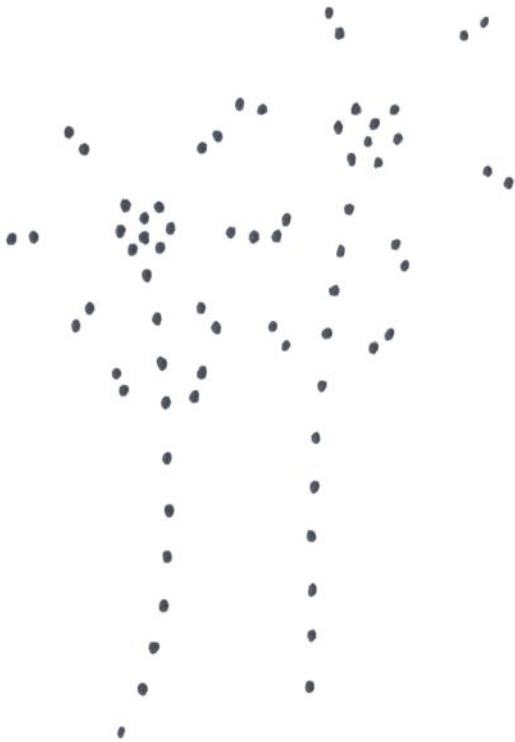
Pattern to punch