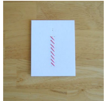
6. Completed First Step