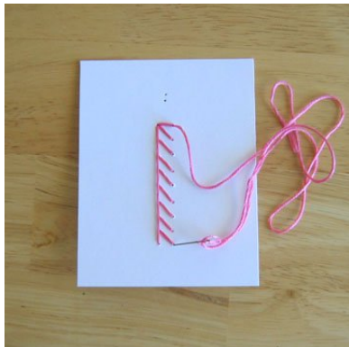
7. Stitching Second Step