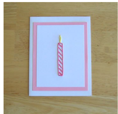
12. Greeting Card Complete