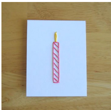
10. Stitching Complete