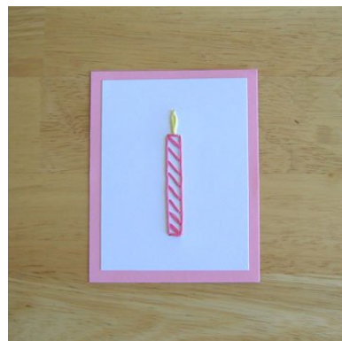
11. Cut Accent Piece