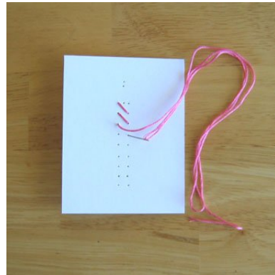
5. Stitching First Step