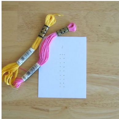
4. Ready to Stitch