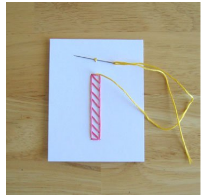
9. Stitching "Loop" Stitch