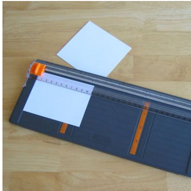
1. Cutting Punch Card Piece