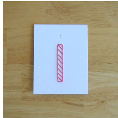
8. Completed Second Step