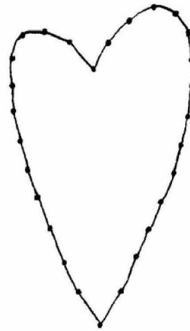
Pattern with thread - example

Line the pattern over cardstock paper. Punch only the dots with an awl or a push pin through the pattern and the cardstock. Only punch holes where the dots are shown on the pattern. Then stitch through the punched cardstock using a cross-stitch needle and thread. Use all 6 strands of thread and tie knots on the under side when you begin and when you finish. Look at the stitched example for help.