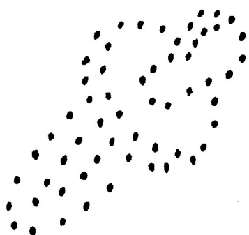
Pattern to punch